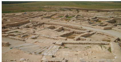
TEL BE'ER SHEVA ARCHAEOLOGICAL SITE (BIBLICAL BE'ER SHEVA)

In Israel today, Be'er Sheva is the 8th largest city; home to schools and yeshivas, Ben Gurion (one of Israel's major universities), several colleges, Saroka hospital, a Rabbinical Court and a regional court, industrial areas, a Bedouin market and modern malls, hotels, a high-tech complex, community centers, a sinfonietta that plays for a 712-seat hall and Glidat Be'er Sheva, an ice cream factory that is almost as old as the state itself.