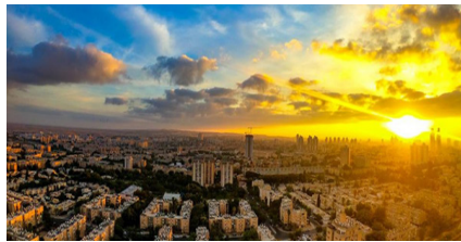
MODERN DAY BE'ER SHEVA

Yaakov's departure from the land of Canaan, along with the promise of "I Myself will also bring you back" (46:4), takes place in Be'er Sheva. This was the place where his father and grandfather both invoked Hashem's name and merited divine revelation, not to mention lived their lives and dug their wells.